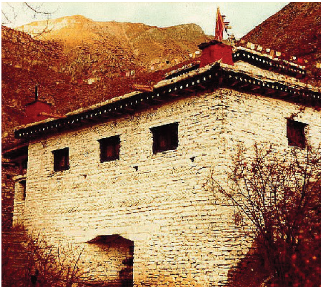
The "Temple Of Miraculous Fire" at Muktinath, Nepal. Photo by Ken Street (Nov. 1979).

[For more on this subject, please read our tract The Temple Of Miraculous Fire .]